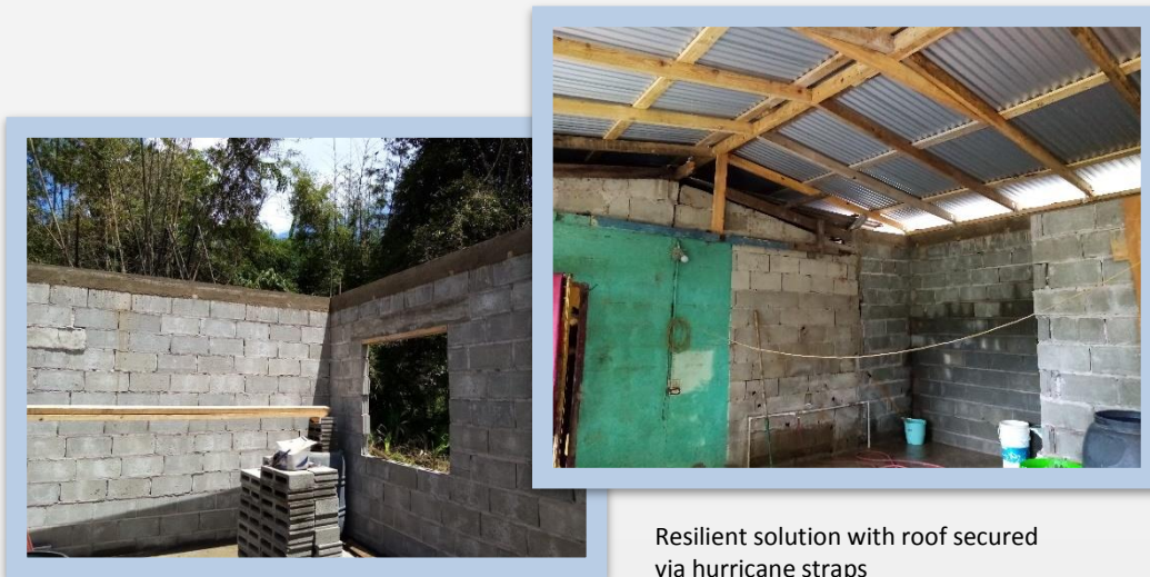
Resilient solution with roof secured via hurricane straps

The intervention under this project has provided the homeowner with a structure that can now stand resilient to a future disaster.