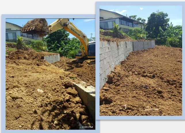
Backfilling and completion of retaining wall

Here we have one of the retaining walls of this quarter Jul-Sept.